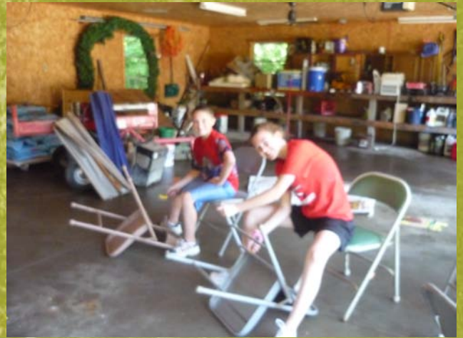
Above: Volunteers from Illinois and Wisconsin enjoy renovating over 50 folding chairs for the dining hall and Holy Family Altar

Right: Volunteers wait for their cars to take them back to camp, but they will return again the next day.