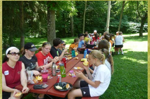
Below: Volunteers relax and enjoy lunch after a Morning of community service.